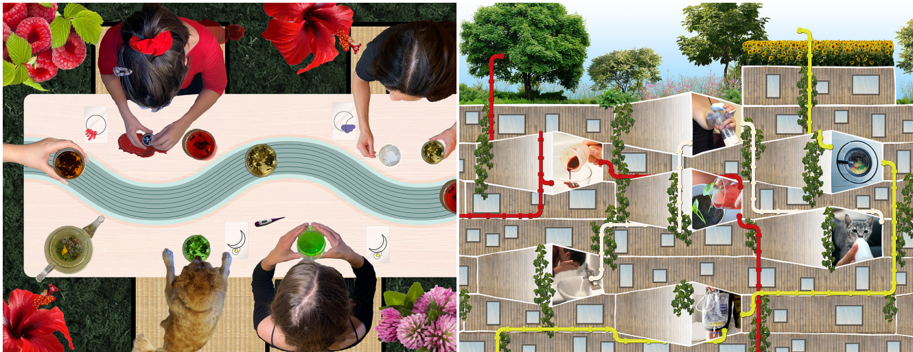
Figure 1: Left image: Magical discharge rituals: Spiritual bleeding and careful witchcraft. Right image: Bodily fluid infrastructures: Visible tubes for traveling nourishment.

with others' bodies and fluids, by means of our intimate individual or community practices (such as managing menstrual care, or breastfeeding), societal norms (whether or not a fluid has a stigma attached, and to what extent we are willing to share or hide these fluids), infrastructures (public toilets, waste management systems) or ecosystems (local ecologies) [29, 41, 83].