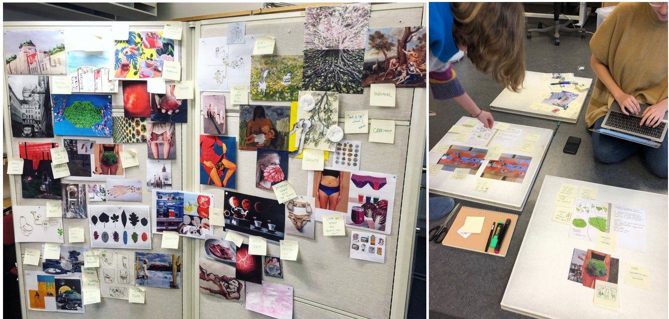
Figure 2: Left image: For the first critique session, we brought and printed out images as inspiration for the fabulations. We pinned them up on a board, annotated them and made connections between them. Right image: For the second critique session, we each prepared a first idea for a fabulation, which we had sketched out or made an initial collage of. We annotated and further developed them together.

where fluids go. This created tensions between macro and micro perspectives of bodily fluids to connect more-than-human material qualities, such as microbial composition, to cross-species and infrastructural pathways of collaborative survival.