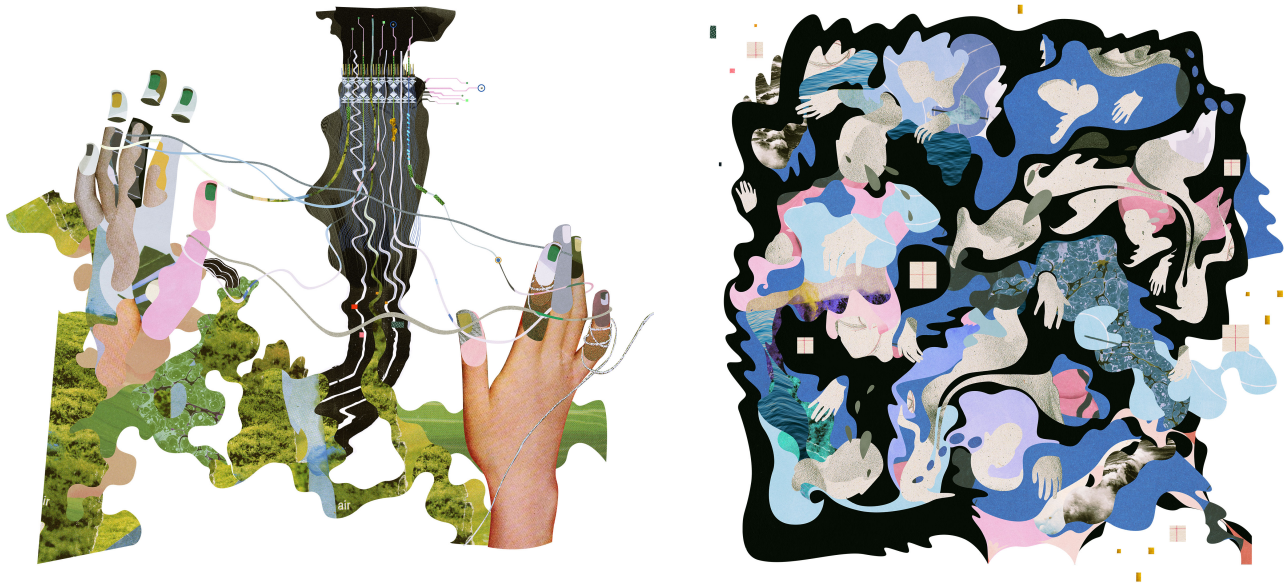
Figure 3: Left image: Diffracting Selves. Right image: Collective Affect.

workshop, we (Vasiliki, Noura, Tom and Pedro), the authors involved in this fabulation process, identified emerging themes for biodata design future research: pushing the boundaries of what counts as biodata and bodies, attending to a greater diversity of human bodies and experiences, and scaffolding biodata collaborations between human and Other (non-human) bodies. These themes emerged from the analysis of the workshop material, as well as further discussions and reflections on the future of biodata design research that continued for about a year after the workshop. As a next step, we wanted to continue exploring and reflecting on how biodata have biopolitical implications and how we can imagine alternative biodata design futures, using ideas of scale, collaboration and crafting different measures, presented in the published paper including the fabulations on Scaling bodily fluids (i.e., "Case Study 1"). The three themes of biodata design research that we used as a starting point had already a theoretical commitment to feminist perspectives and post-anthropocentrism, so we engaged in this topic and process thinking through and with human and non-human bodies.